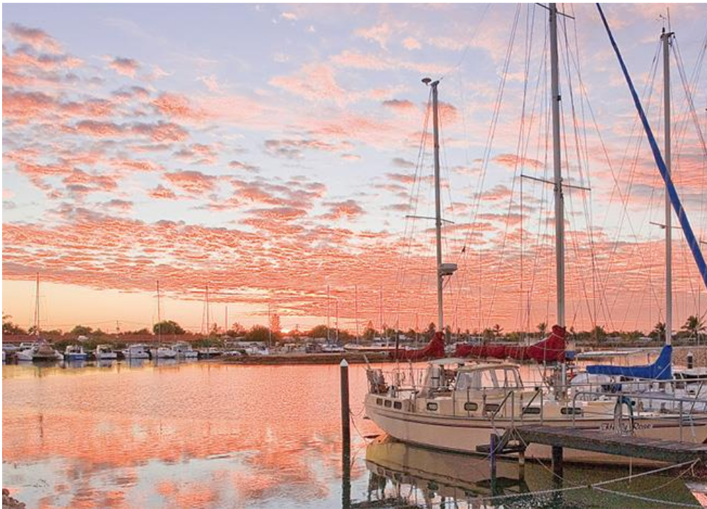
REPRESENTING AND SUPPORTING YOUR LOCAL BUSINESS